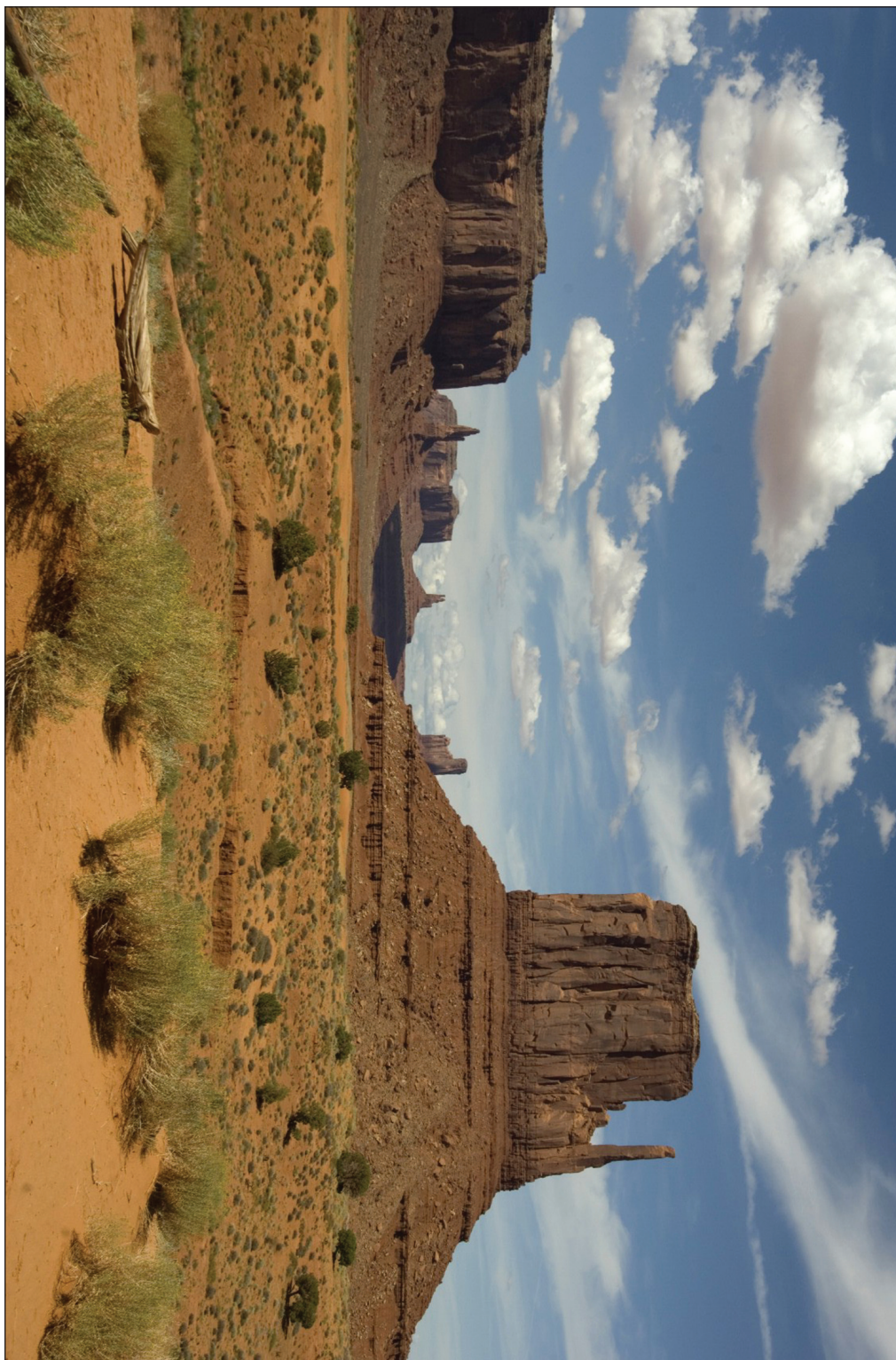
Fig. 3 Monument Valley, Utah, U.S.A.